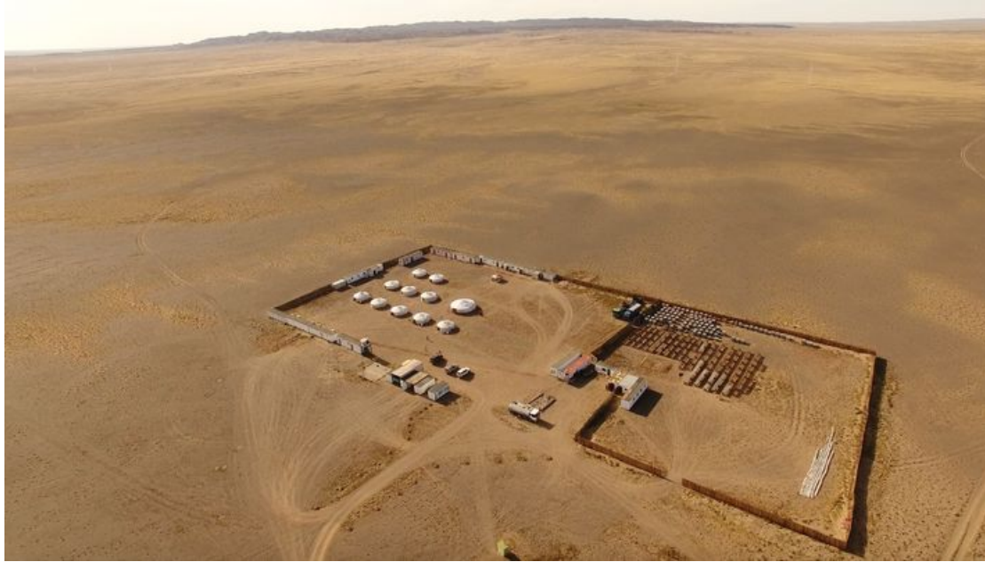
Kincora is gradually working up the targets on its plus-1,500sq.km of land in the Gobi

"The geological theory goes: if you're going to find tier-one assets it is most likely to be in those devonian rocks that host the two existing large-scale economic projects in the belt," Spring told Mining Journal .