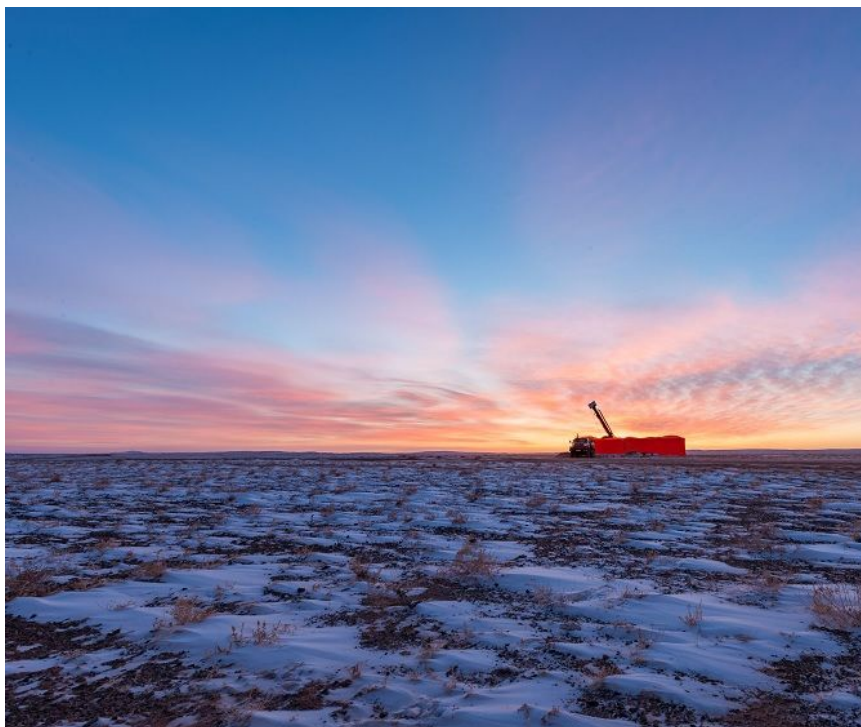
Xanadu has been working on expanding its 2015 resource at Kharmagtai

Kharmagtai accounts for the majority of Xanadu's circa-A$150 million (US$118 million) market capitalisation, but it also has the Oyut Ulaan project, 260km east of Kharmagtai, to its name. This has some interesting porphyry and epithermal gold targets highlighted by intersections such as 184m grading 1.06% CuEq from surface and 3m at 13.28g/t Au.