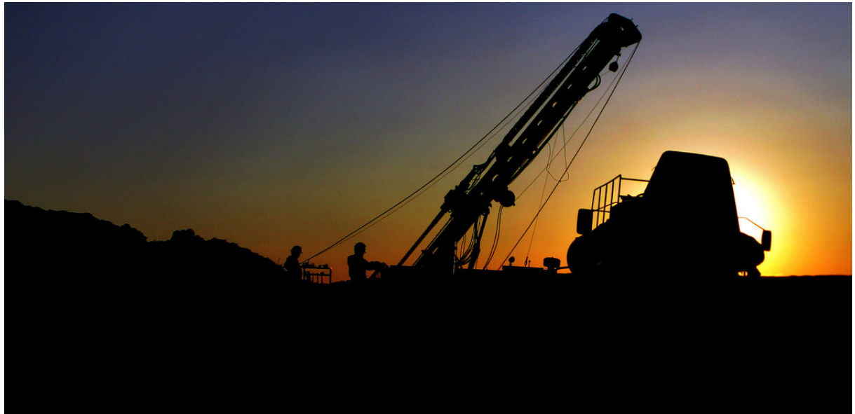
Mongolia's improving political backdrop bodes well for companies exploring there

Exploration / Development > Resource-definition